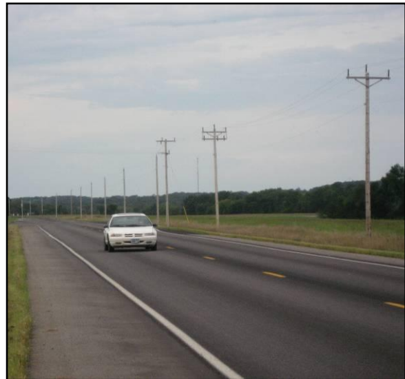
Route AS-5 (County Road 138)